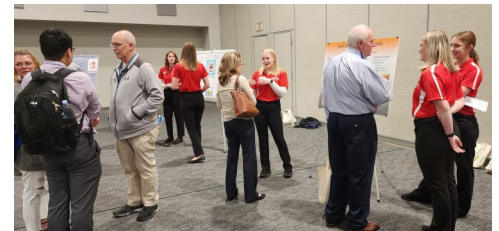
EXHIBIT HALL CASH PRIZE DRAWING

Come and check out the USD dental hygiene student projects that will be on display. The students work hard researching and preparing their clinics. Stop by, ask questions, and network.